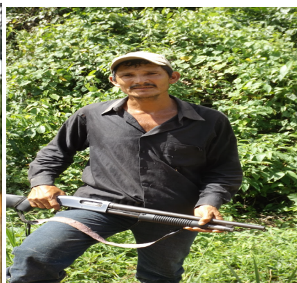
COLONOS (we personally took these shot posing as a journalist on their side)