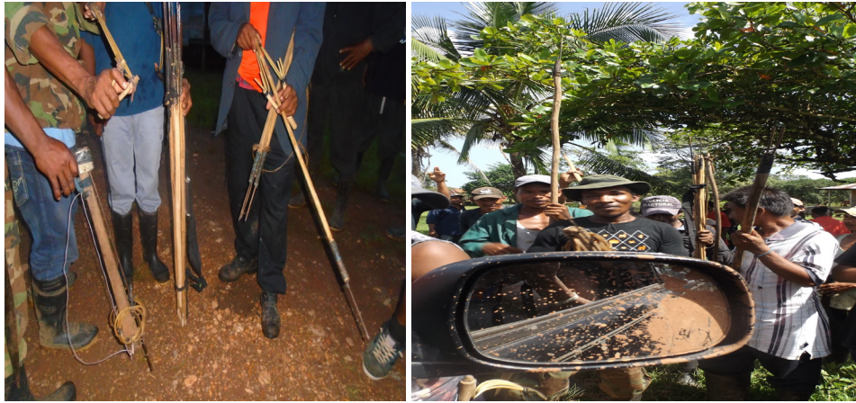
Miskitu Nation Homemade self-defense weapons